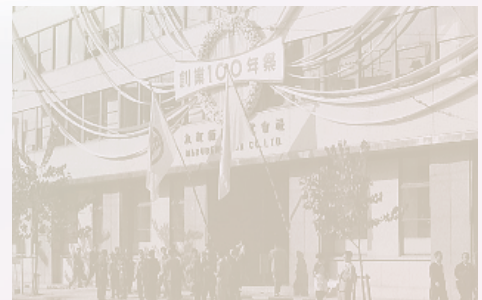
1958 Celebrated its centennial