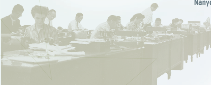
1951 First overseas subsidiary was established in New York