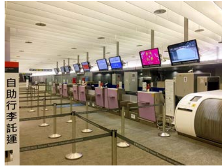
In-town check-in counters