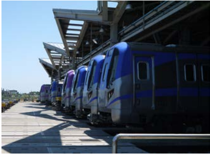
EMU (Electric Multiple Unit)